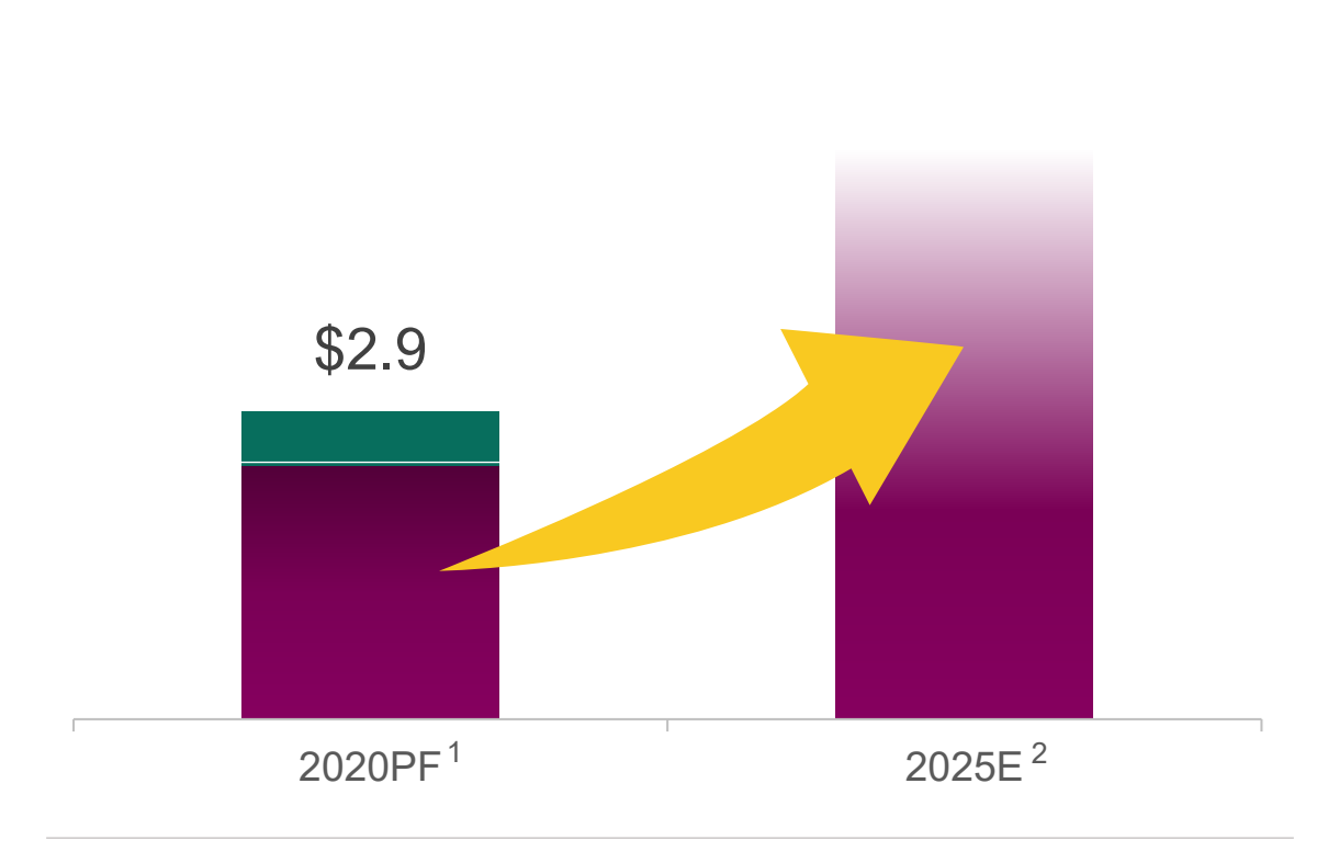
Accelerated, Double-Digit Top Line Revenue Growth